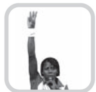
HELD BALL (3secs)