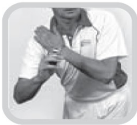
CONTACT - Shoulder