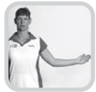
DIRECTION OF PASS