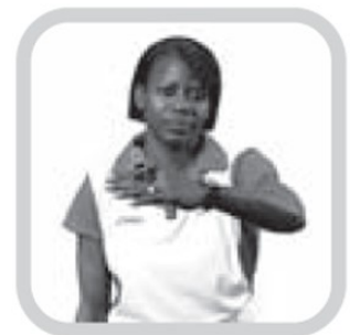
OFFSIDE & OVER A THIRD