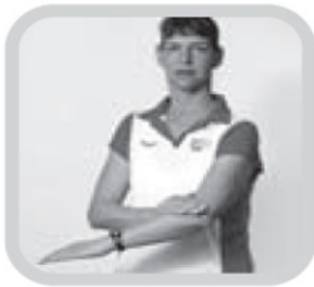
CONTACT - Arm