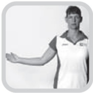
DIRECTION OF PASS