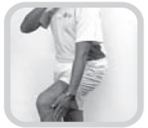
CONTACT - Leg